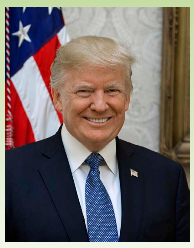
DONALD J. TRUMP President, United States of America

The President can order National Guard personnel to federal active duty during a national emergency and also can mobilize units to support active-duty forces perfoming DoD missions.