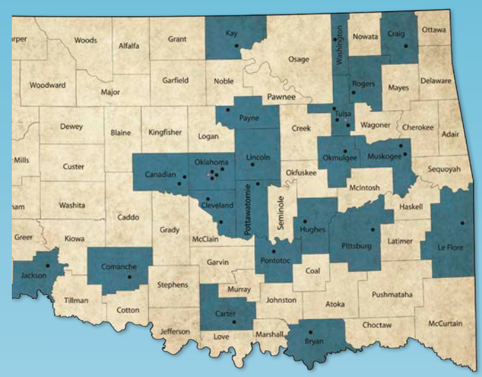
Oklahoma Army and Air National Guard locations