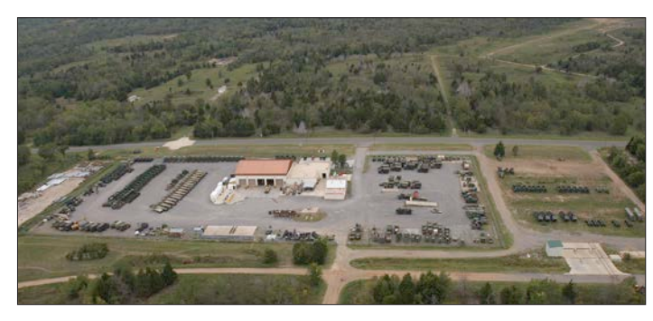
Camp Gruber Unit Training Equipment Site (UTES)

These facilities employ 105 maintenance technicians and generate an annual payroll of approximately $5.6 million. During FY11 a total of 5,222 work orders were processed on 17,524 items that included vehicles, weapons, and special purpose equipment. The FMSs had 39 full time technicians mobilized during FY11.